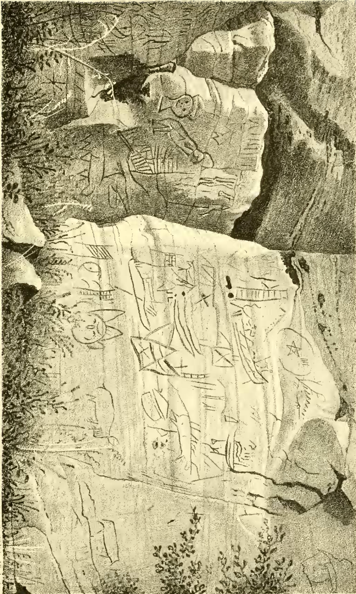
INDIAN HIEROGLYPHIC ROCK ON SMOKY HILL RIVER, KANSAS.